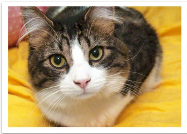
Bongo-loaf.