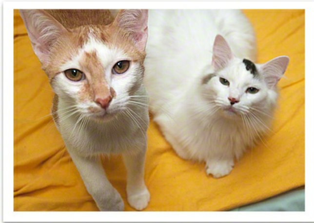
Barney and George.

There were a few bumps in the road, particularly with Bongo. I noticed he'd pant after a short period of playing and at rest his respirations were far faster than the normal, roughly 20-40 per minute. This concerned me greatly because I'd lost a cat to HCM, hypertrophic cardiomyopathy [3] and the only sign I had that something was off was his breathing had a "hitch" to it. By the time I knew he was really ill, it was too late and he passed away during attempts to treat him. Ever since that horror, I've been more vigilant.