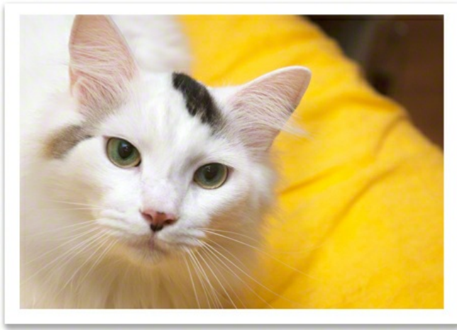
Oh George, I will forever swoon when I think of you.

There were a few bumps in the road, particularly with Bongo. I noticed he'd pant after a short period of playing and at rest his respirations were far faster than the normal, roughly 20-40 per minute. This concerned me greatly because I'd lost a cat to HCM, hypertrophic cardiomyopathy [3] and the only sign I had that something was off was his breathing had a "hitch" to it. By the time I knew he was really ill, it was too late and he passed away during attempts to treat him. Ever since that horror, I've been more vigilant.