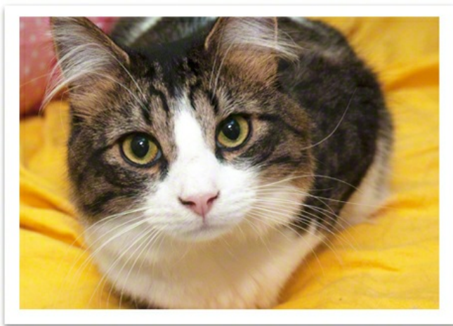
Bongo-loaf.