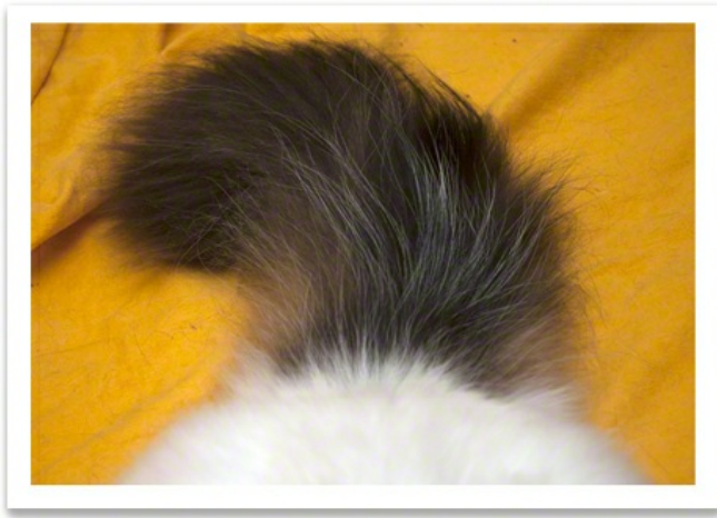
The tail of tails.

We decided to do the treatment for Bartonella, then wait to see if Bongo improved before going to the next step, which would be doing an echocardiogram, the only way to see the thickening in the walls of the heart that is indicative of HCM.