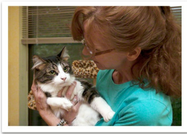
Bongo and Mama.