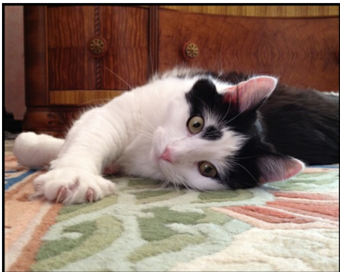
the DOOD this morning

the DOOD has blossomed in more ways than one. He weighs 14 pounds, 3 ounces! He runs like a drunk rabbit. He “hog piles” onto Blitzzen, then attack-licks him. He climbs into the kitchen sink and he chases after the other cats for pure sport. He’s not perfect in every way, but my he’s my perfect little brat.