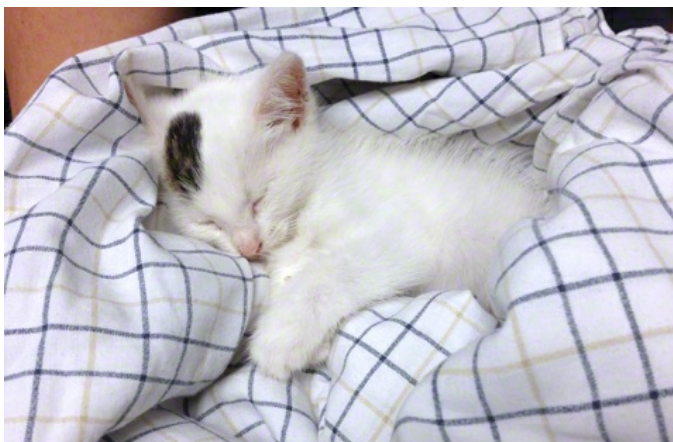
Too tired and weak to run around.