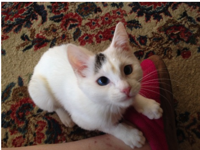
In January Freya was doing great.

Freya beat the odds. The first day I met her last September she weighed a pound and was far too tiny to operate on. They gave her a 10% chance to survive unless I could keep her going until she was bigger. I struggled with her-getting her nutrition, but without bulking her up more with stool. By mid-December, she was near to bursting so I had to rush her to Boston, to MSPCA-Angell Memorial, for the very delicate and rare procedure. (For more on Freya's backstory, see the end of this post for a list of links).