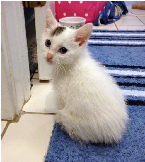
My first days with Freya when she was just a tiny kitten.

How did five months come and go so quickly? To say it's been a blur is an understatement. In our last chapter about Freya, it was December 2014 and she'd just had successful surgery to create a rectum so she could finally pass stool. She was barely four months old and was at very high risk of dying if the surgery didn't work or from complications after the procedure.