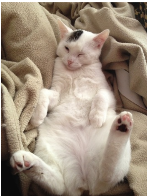
Life is good.