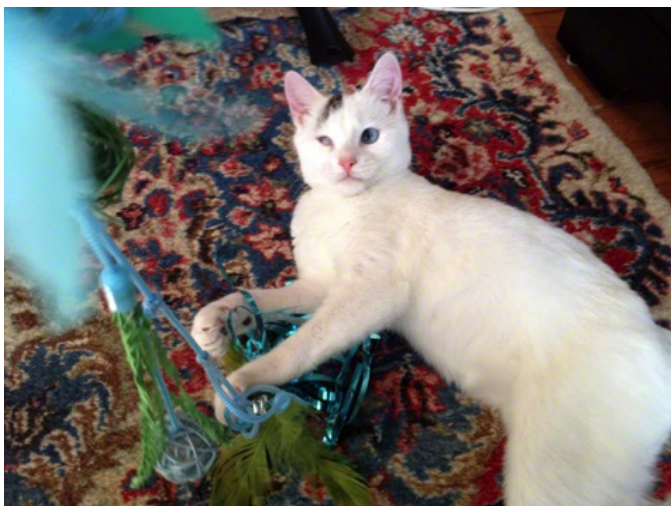
Freya, as always, never lost her cheerful attitude. She just adjusted to not being able to see well.

We were very lucky that their ophthalmologist was available. She was able to tell us that Freya's eye was fine, but she had Horner's Syndrome (2), which is a neurological disorder whose root cause could be one of many different origins. There was inflammation of the optic nerve that forced her third eyelid to rise from its otherwise normal position. There was no cure other than to wait and hope that it would resolve on its own. For now Freya was basically blind in one eye. Add that to her ever-growing list of deformities and this cat had one heck of a tough burden to bear.