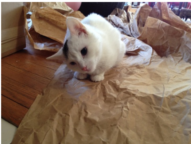
My lopsided foster kitten.

Though it's a bit of a misty memory now, we'd followed up by doing some blood tests on Freya. It showed she was positive for Bartonella, the bane of my existence. She probably got it from being born outdoors and being exposed to fleas. We began treating her for that when I started to notice she seemed to be holding her head at a weird angle.