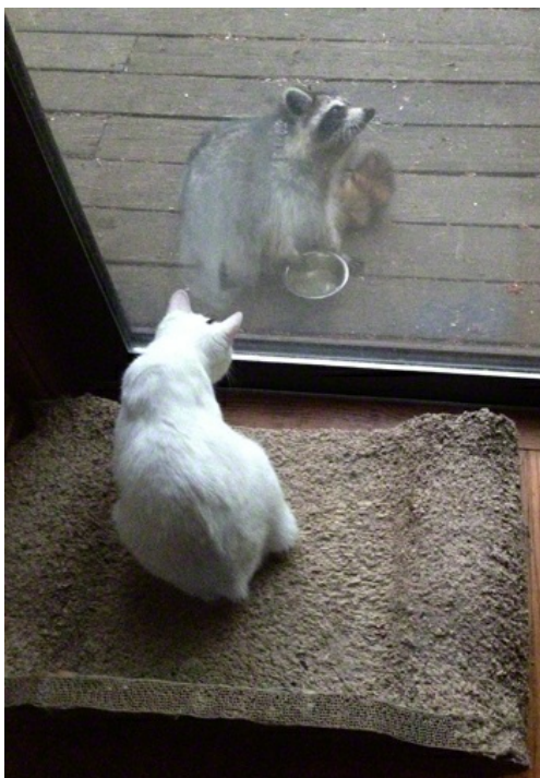
Freya meets the raccoon.