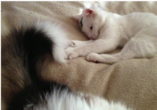
Freya's tail obsession goes into overload when she sees Spencer's tail.