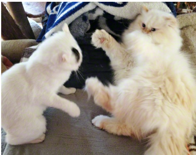
Freya vs. Fluff Daddy.