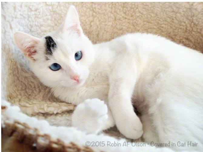
Our Freya.