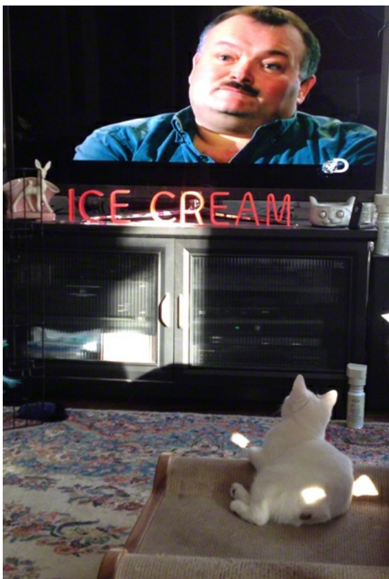
Yes, Freya watches TV.