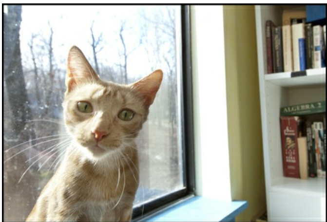
Bobette a few moments after arriving.

I also wanted to spend some time with Bobette and the boys. I didn't have a chance to get to know them that morning, so now was the time.