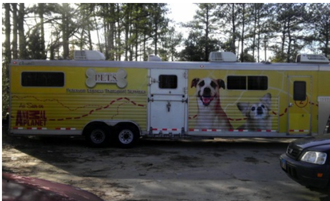
The transport awaits.