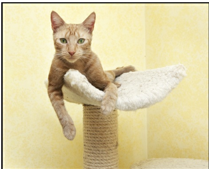
Lanky, lean and lovely-Bobette.