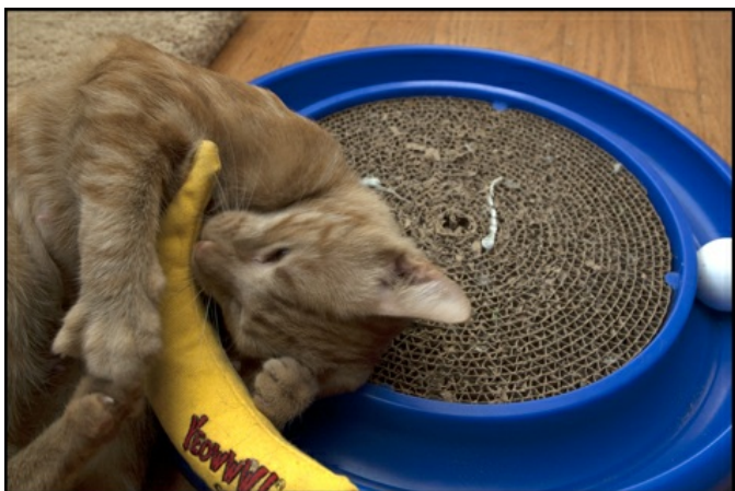
Bananas are good fun.

We got some applications and I met with folks who had emailed me about stopping by to visit the kittens. It was all going well when all of a sudden, I heard one of the Angel Babies furiously meowing and scratching at the plastic tray bottom of their crate. As I lifted the cover off the back of their cage, my nostrils were violated by a powerfully nauseating smell. Then, I saw it-diarrhea! Ugh.