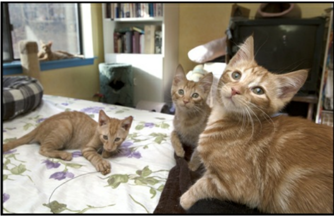
Da boyz.