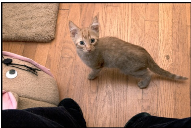
Hello! This is Teddy or Mikey. I think it's Teddy.

The orange boys did fine. They were bouncing around, having fun. They laid on each other and the three of them started grooming each other. It was so cute that it made everyone forget the lingering stench, as they crowded around the cage, "ooo-ing and ahh-ing."