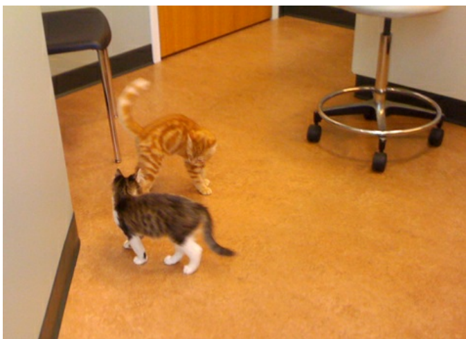
Givin' some sass to his sis.