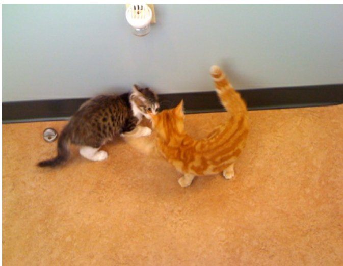
Polly and Chester preparing for their next "Battle Royale."

Cara's always cold. I have a space heater running in her room 24/7. She still likes to sit on the top of it as it rotates back and forth. She prefers it to the electric blanket on the bed, but that's there for her, too. I've done everything I can think of to help them get better. The rest is up to them.