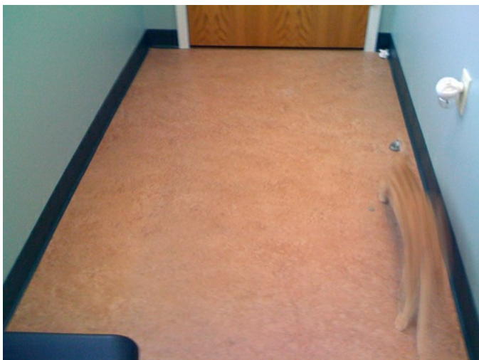
It's a bird! It's a plane! It's super-cat!