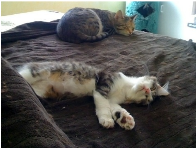
Mazie and Polly have a nappy on the electric blanket.

And here we are. The family has been with me for a month. I'm still doing, at least a weekly Vet run. These cats have been chronically ill, to the point of which I wonder if they will ever shed their illness.