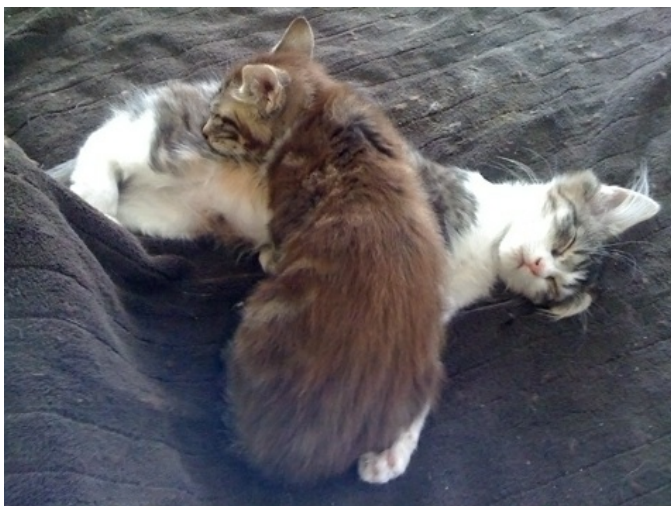
Cara warms up on her sister, Polly.