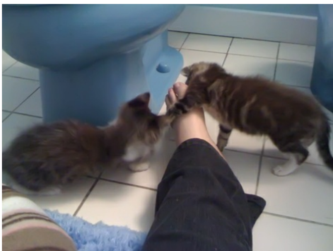
Even though she's sick, Cara still played with her sister. A good sign.