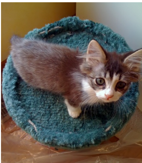
Polly returns to kicking butt, even though she's still snotty.

I couldn't get home fast enough, both to avoid the weather and to get Cara and the others warming up. It took about five minutes for the kitties to realize the blanket was warm and later that afternoon, I found them all stretched out sleeping.