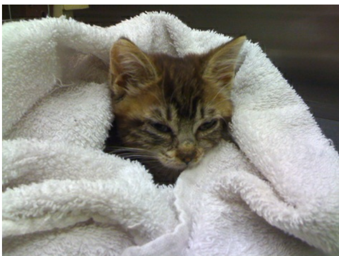
Cara was so cold she didn't mind being bundled up at the Vet.