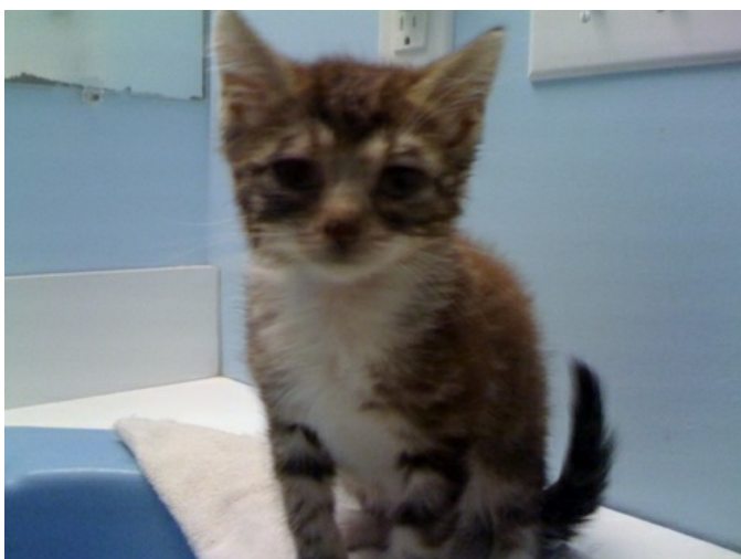
Oh dear! Back to the Vet, or keep her warm and stress-free? What's best?

Cara is a tiny little thing. She's over a pound lighter than her brother, Chester and she's about the size of a six week old kitten. Her paws are no thicker than my pinky. Last night her eyes were sealed closed. She wasn't as snotty as Polly had been and even being blind, she found her food and ate quite a good bit of it. Her belly is really BIG and I just de-wormed the cats two days before. I do not want to say things like FIP, so for now I won't. Cara has been vomiting, still, very small amounts and only every few days. Since the de-worming she hasn't vomited, but that could change.