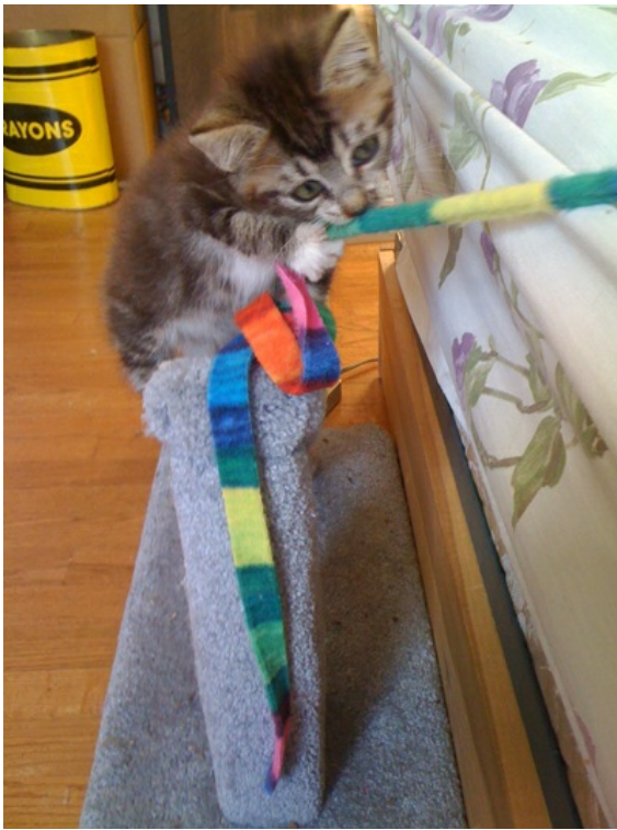
A few days ago, Cara was doing fairly well.

Polly's left eye sealed shut AGAIN. That eye has been a problem for her since the beginning. I took her into the bathroom and ran the shower. She was VERY snotty and was very tired. In a day or so she perked back up, so I didn't have to do another Vet run.