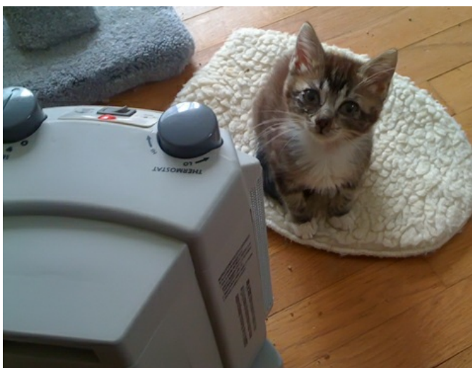
Instead of sitting ON the space heater, I found Cara in front of it, so I put a little cat bed out for her.

The next night Polly took another turn for the worse. This time it REALLY scared me. She was open-mouth breathing, with her left eye sealed shut and her head was VERY SNOTTY . I had just taken her to the Vet the day before and that was 3 vet trips in 3 days. I was wiped out and did NOT want another Vet bill on my hands! I got Polly back into the bathroom for a steam treatment. I ended up having to force feed her to make sure she wouldn't crash over the night. I got up at 4Am to check on her and her eyes were not sealed shut and she seemed comfortable. The space heater was running full blast and so was the humidifier.