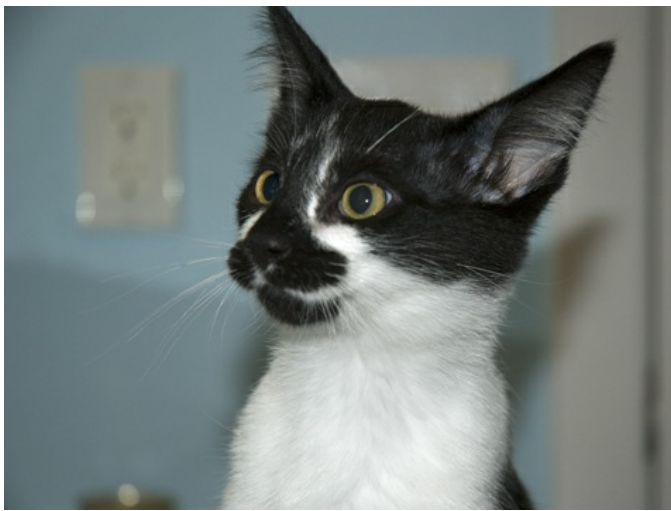
Moonpie, ever the clown, reacts to my singing!

Moonie and Patty are BIG four month old kittens. They have lots of energy and enthusiasm. I hated to put them in a small room, but I made sure they have lots of soft places to rest and some space to bounce off the walls-which from time to time, sounds like what they're doing.