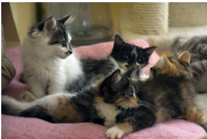
Sugar Pie (left), Yodel (rear), Cinnamon (front), Honey B. (facing away from the camera).

Yeah, these two are friendly cats. No question. They are also a handful! I think they should be adopted together. Patty has a serene quality about her and Moonpie is a goofhead, but an affectionate goofhead.