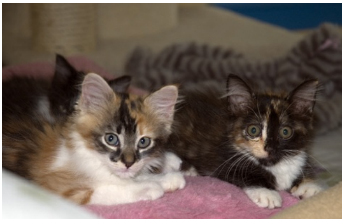
Honey B. with Cinnamon.

The tiny kittens. Well, they are just the cutest things ever. Sugar Pie has a nickname-“Mini-Spencer.” Her markings are very similar to Spencer's and it looks like she will be just as fluffy! Her top coat is sparse and very long. I wonder what she'll look like when she grows up? As if I even have to wonder!