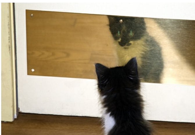
Yodel sees his reflection.