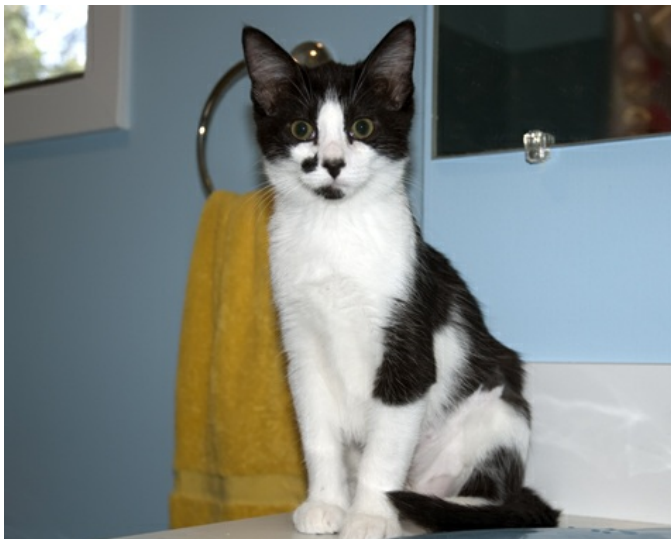
Pattycake.

They don't seem to mind. Moonpie's runny eye has cleared up and though he sneezes, it seems to be dry and a rare event. His appetite is great and he seems to be doing just fine. That said, I'm not moving him back to the room with the kittens any time soon. He is just too big and they are just too small.