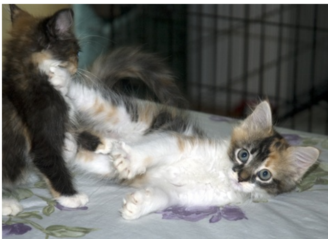
Honey B. demonstrating Kung Fu Fighting. She's got skillz!

Cinnamon. Who wouldn't love this little "owlette?" She's sweet as can be, but far too tiny. She's skin and bones, but her appetite is great. Her siblings are far larger than she is, so I find myself very protective of her. I wonder if she has tapeworm on board-which would answer why she is so small and hungry. The de-wormers we use wouldn't kill that parasite.