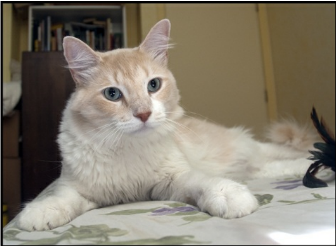
Finally sitting up and looking well rested at last!