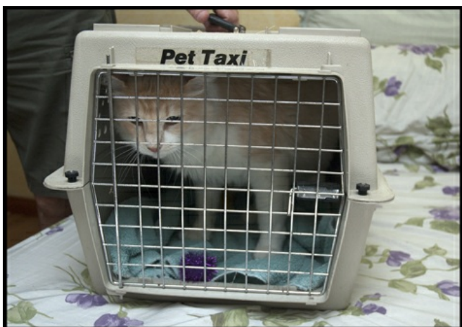
One last road trip to make it home.

Phil leaving was like ripping off a bandage. He wasn't here long enough for me to fall head over heels. He was here long enough for me to see what a special guy he is and how lovely he is. He really perked up and got playful before he left. He would "lumber" instead of run. It was really cute. His legs go for miles. I think he can't get out of his own way some times.