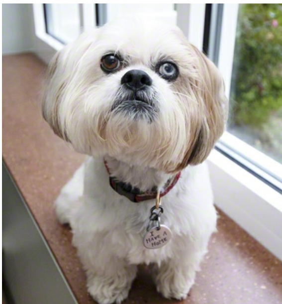
I have a home, indeed.