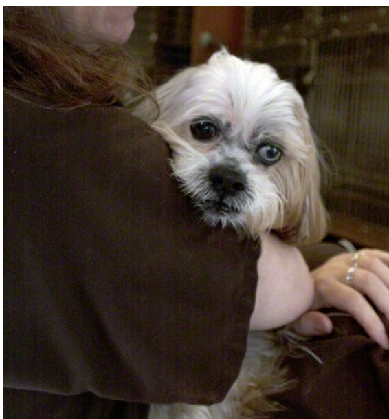
With mama.