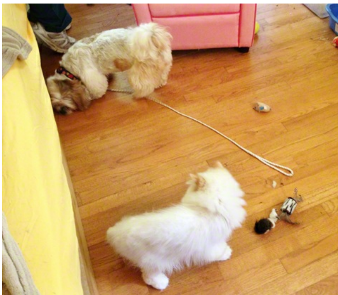
Just before Fluff grabs Jayne's leash and takes off