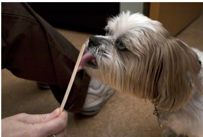
A treat after walks.