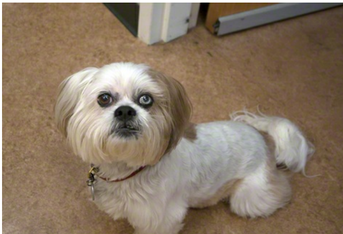
Jayne Dog.

She was short and muscular with bowed legs and a wiggle-waddle rhythm to her walk. She had long hair kept carefully groomed so it wouldn't fall across her googly-shaped eyes. Every time someone saw her for the first time they'd remark: "Did you know she has one blue eye and one brown?" In fact yes, we DID know that and we even noticed that the brown eye was a bit bigger than the pale blue one. Some times I wondered if her vision was a bit different in each eye, though if she had any vision issues it never stopped her from chasing foolish birds who skittled across her path.