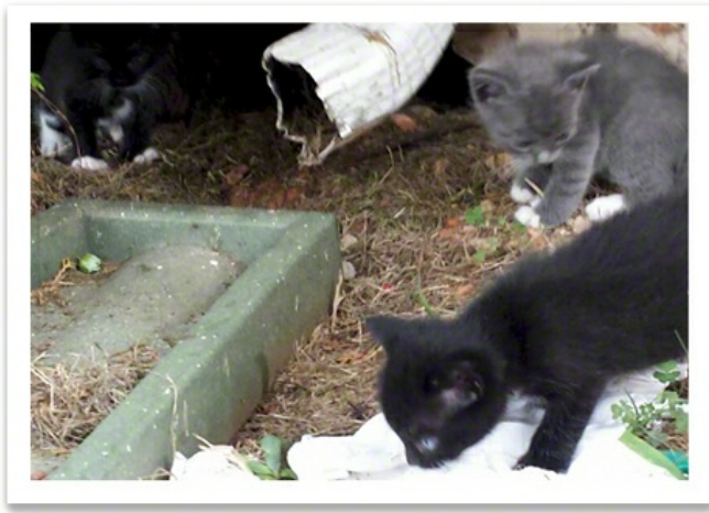
Oblivious to the dangers nearby, the kittens explore their new world.

The woman lifted the carrier and brought it over to the side of her house near some shrubs. She unzipped the mesh door and let the cats go free. She couldn't take the family inside. As the kittens scattered out into the lawn, she walked into her home and after a few minutes came back outside with some food and water, which the mama ate greedily. The kittens were unfazed by their brush with death and not fearful of the woman. They got to work playing in the grass, oblivious to the fact that there was a dog in the back yard who had just mauled another dog to death the day before. Their freedom may have just put them into a more dangerous situation than they were in before and something had to be done.