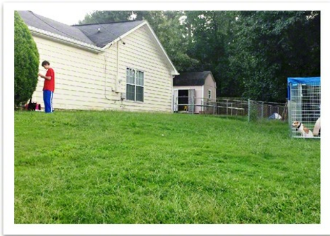
Mama is standing by the boy, so close to a very dangerous dog. It wouldn't have taken much for any or all of the kittens to wander too far in the wrong direction.

The woman lifted the carrier and brought it over to the side of her house near some shrubs. She unzipped the mesh door and let the cats go free. She couldn't take the family inside. As the kittens scattered out into the lawn, she walked into her home and after a few minutes came back outside with some food and water, which the mama ate greedily. The kittens were unfazed by their brush with death and not fearful of the woman. They got to work playing in the grass, oblivious to the fact that there was a dog in the back yard who had just mauled another dog to death the day before. Their freedom may have just put them into a more dangerous situation than they were in before and something had to be done.