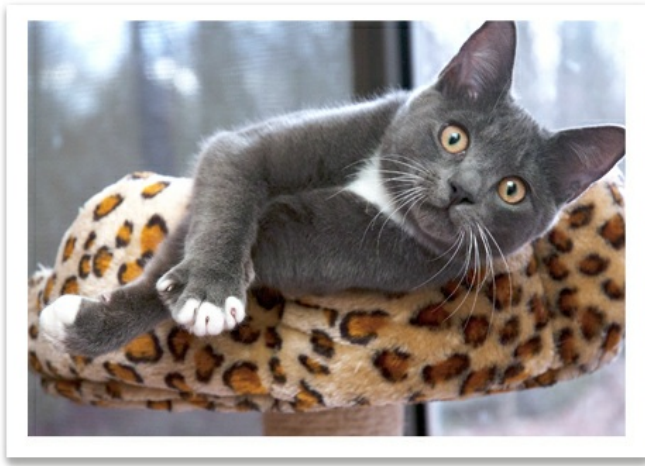
'Zellie poses for the camera.