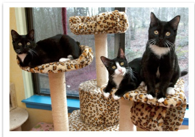
Linzer, Biscotti and Nanny (right). But really who can tell the twins apart. Good thing Biscotti has white on his face.