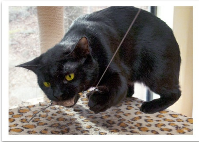
Mocha was just as playful as the kittens. She's just a big kitten, herself.