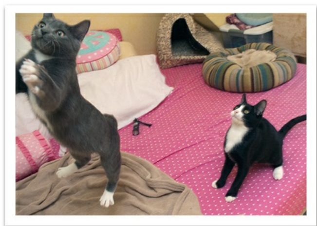
Biscotti is amazed at Pizzelle's high-flying chops.