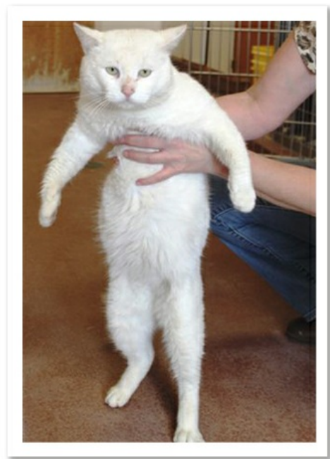
My first glimpse of Jackson.

Almost a year ago I saw three photos of you in an email from a kill shelter in Georgia. In one of them someone was holding you up under your front legs, while you stood on your back ones. It was clear you were a big cat, with a big “biscuit head,” but there was something so sad about your expression that touched my heart. Perhaps you had given up and for a two-year old cat to feel that way, just wasn’t right. Even though I don’t often take on adult cats, I had to save your life.