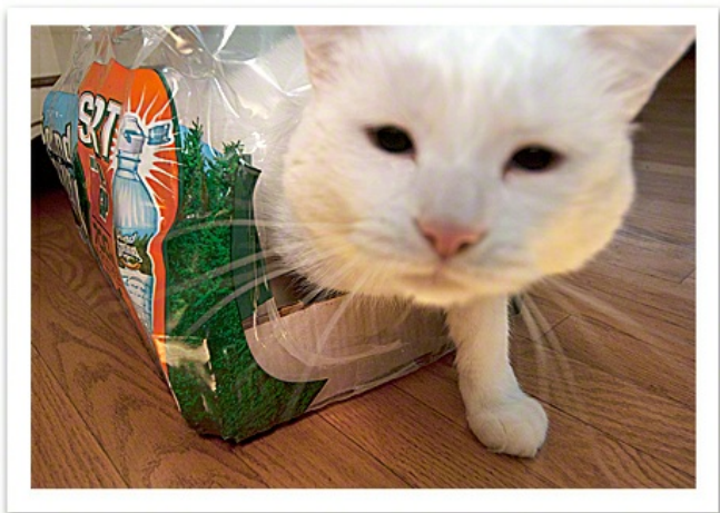
This silly side of Jackson emerges.

I felt you needed to come here and be with me until we could find you another home. I counted it up and you’d lived in seven places in the past six months. The last place I wanted you to be was back at the shelter. You needed a break, a home and lots of attention.