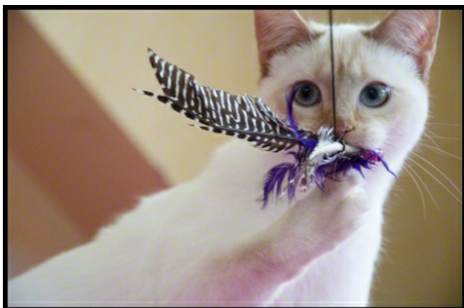
Coco, another former foster kitten loved hunting feather toys.

Twitter [3] and Instagram [4] pages where you can tag your images with #CatsTrueNature. Make sure your images celebrate cats in four different scenarios - leaping , sprinting , stalking and performing one other "wildcard" pose like chasing or catching - for a chance to be featured in the Pro Plan community.