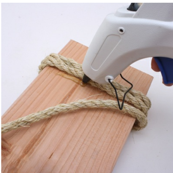
Used with permission from the author. Lovely, clear photography enhances the "how to" section of the book.

KB: Senior cats or cats with mobility issues do require special consideration. Definitely make sure that any surface they are climbing on has a non-slip covering, like a sisal rug remnant or rubber-backed floor mat, to give them better traction. Make sure that climbing shelves are nice and wide and you can even add a little railing on the edge. Ramps are very useful in households with senior cats or cats with mobility issues. We show you how to make a simple cat ramp on page 183 using just a board and some sisal rope. This ramp can be used to help cats climb up to places where they can no longer jump. The sisal rope gives them plenty of traction and serves double duty as a scratcher.