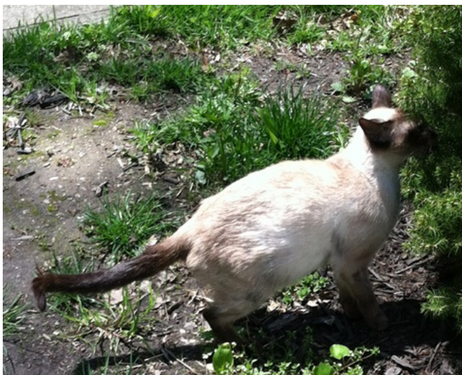
Our first look at Celeste, pregnant and on her own, dumped by her family who didn't have use for her any longer.

It wasn't my fault. I wasn't a total loser. We'd lost a great cat and that would never change. Hopefully if, God-forbid, her kittens have this disorder we will know and maybe they can still have a good life. I don't know if that's even possible, but we'll do our best.