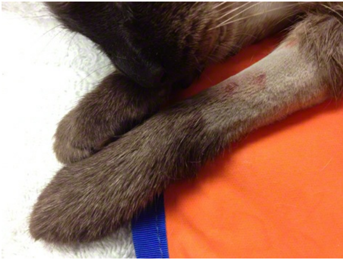
Farewell beloved girl.

I held Celeste's paw and said goodbye. I petted her as I told her how sorry I was for letting her down. I said I loved her again and many other things as I looked at her lifeless body, secretly praying that like on a TV show maybe her heart would miraculously start beating again and she would really be just fine after all. We'd all hug and smile and laugh, relieved that the nightmare was over. How I wish that had been the case.