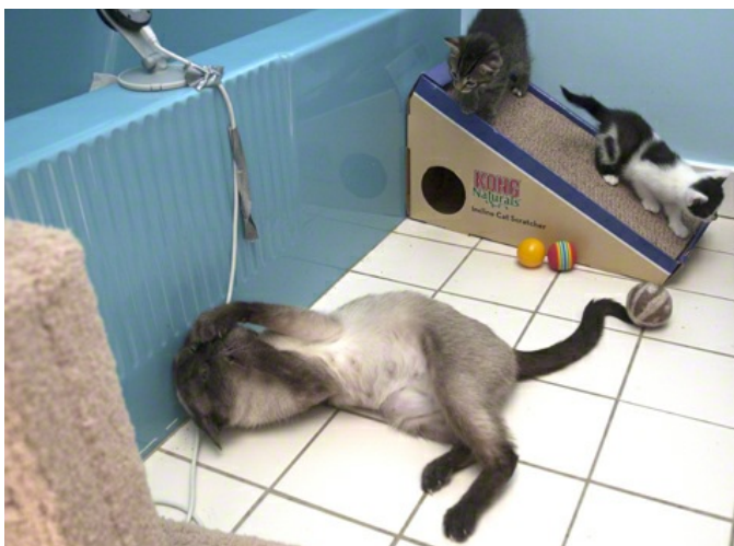
Celeste went crazy over her organic wool pom-poms. She went nuts over catnip, too.