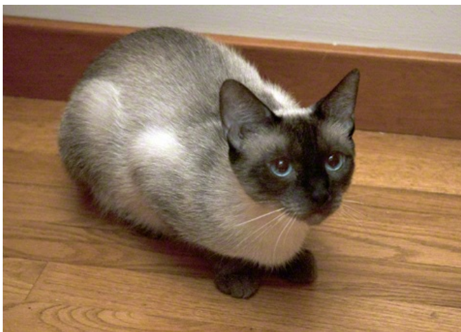
The last good photo of Celeste after her kittens were weaned. She looked so radiant.