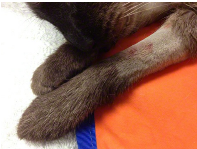
Farewell beloved girl.

I held Celeste's paw and said goodbye. I petted her as I told her how sorry I was for letting her down. I said I loved her again and many other things as I looked at her lifeless body, secretly praying that like on a TV show maybe her heart would miraculously start beating again and she would really be just fine after all. We'd all hug and smile and laugh, relieved that the nightmare was over. How I wish that had been the case.