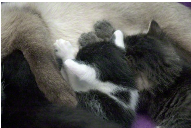
Giving life on so many levels.