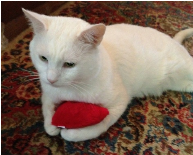
Jackson holding his catnip heart.

He shouldn't have to endure the stress of moving to another home and trying to adjust. He has his home here with us. It's not perfect, but we do love him. We'll keep him in our program because we honestly can't afford to provide for another cat and had no plans to add to our family. We'll set up a special donation page for him and continue to update everyone on how he's doing since I know so many of you care about him and ask after him.