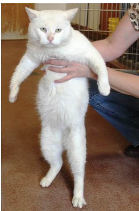
Jackson at the Kill Shelter.

We can't sedate Jackson, so how do we expose him to a long car ride AND an exam at the cardiologist?