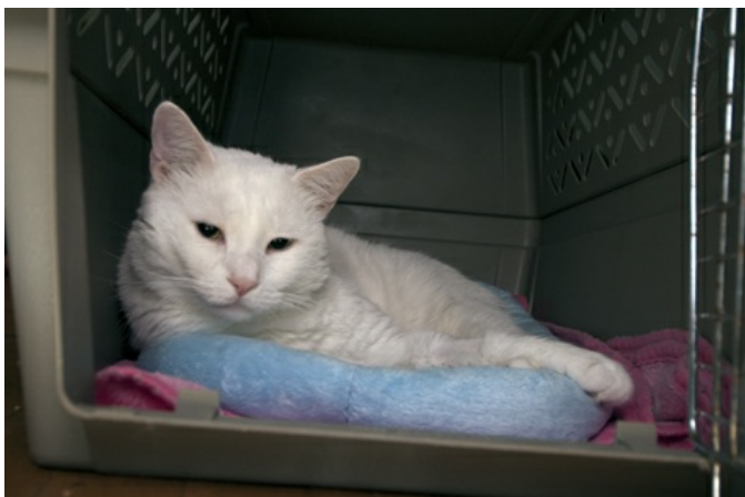
Home from the Vet, Jackson still prefers to hang out in the cat carrier.

I took a chance on rescuing an adult cat, but I never thought it would mean taking on one with a fatal heart condition.