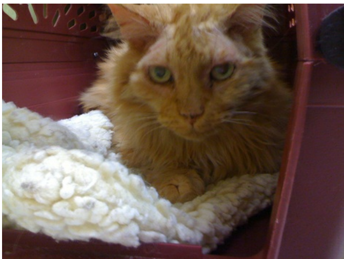
At Dr.'s.