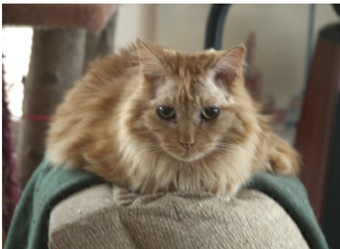
Bob, sitting on the top of my Mom's old recliner!

There was also one other issue-the mass in Bob's chest. IS IT CANCER? Is it lymphoma? Not likely. Is it the cancer that was in his liver-metastasized? We needed to repeat radiographs to see if it had changed, reacted to the chemo. So we said yes to doing more radiographs.