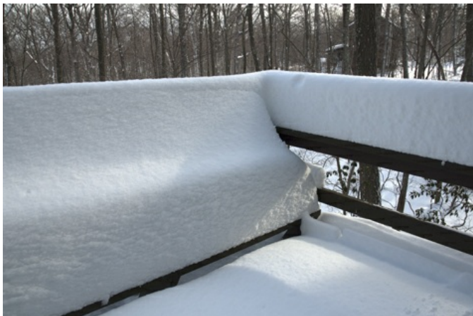
The view of our deck after the storm.

It's not that bad here, but whew...we don't need much more snow to get to that point.