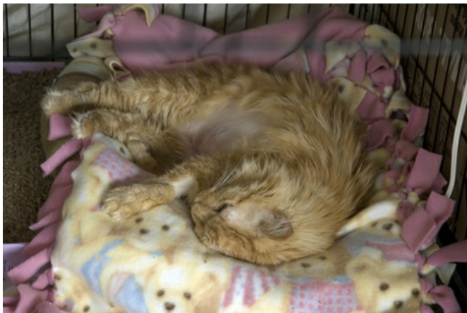
Bob a few days after surgery.