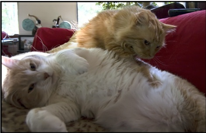
Bob just plowed over any cat that might be in his path. Here Nora is getting squashed.

I began to pay even closer attention to Bob's every move. Was he eating? Sometimes, but not enough. I had to learn how to syringe feed him. This was very difficult-from an emotional standpoint. Here I was FORCING Bob to eat, when he clearly didn't love being fed this way. I had to struggle with him. It made a mess. When I prepared his food, it had to be in a slurry. Too thin and it would drip out of the bird feeder size syringes-too thick and it would be tough for him to swallow and he'd protest by lifting his paw to push me away. I wanted to make sure it wasn't too hot-or too cold. I added baby food to give him more potassium. I added a bit of tuna water or even blended raw chicken liver so it might taste better and so I could get more nutrition into him.