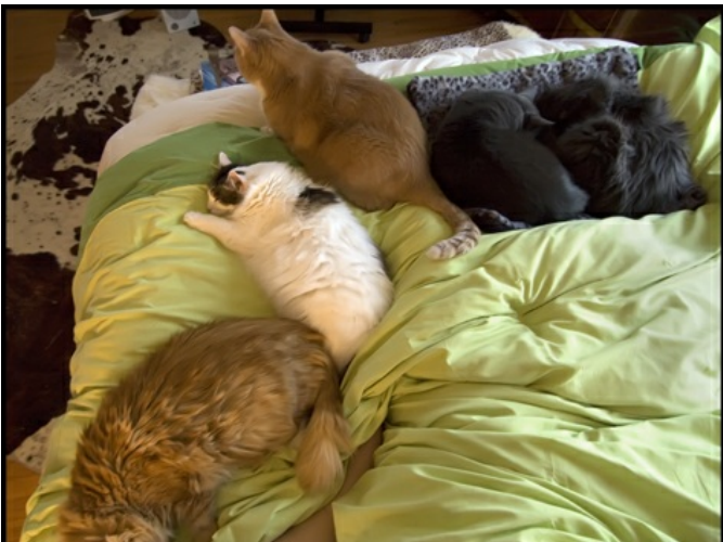
Bob, Spencer, Nicky, Gracie & Petunia (and me under the covers).

It was a struggle, not just with Bob, but with myself. I knew if I stopped feeding him, Bob would die. I knew if I kept going, was I just forcing Bob to live unnaturally? How could I live with myself if I just watched Bob starve to death? Yet, he was getting thinner and thinner no matter what I did. Every day I was shocked to my core at the sight of him. I couldn't believe he could get so thin. We were feeding him every 4 or 5 hours with small offerings between that. It was exhausting, but it had to be done.