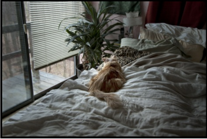
Goodbye my sweet friend.

and her five kittens and said; "My cat just died." I hung my head and cried.