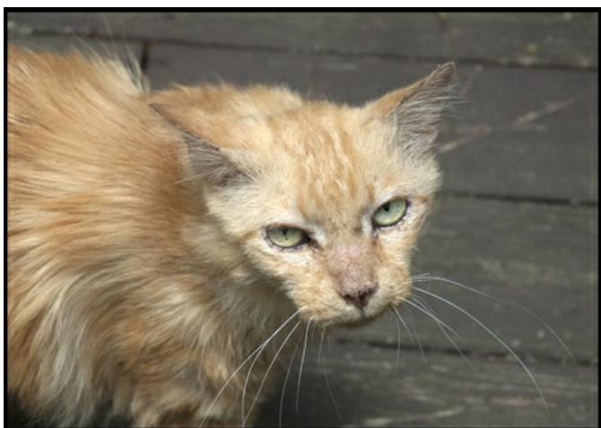
Growing ever thinner, Bob still enjoys being outside.