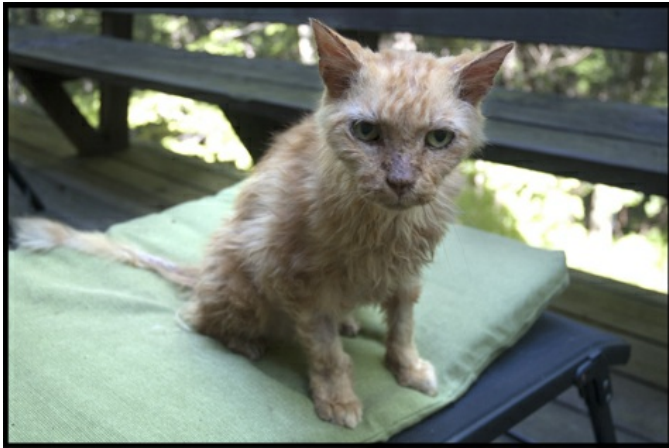
All of his glamorous fur gone and still losing weight, Bob still had his dignity.

All I could say was; "Oh no...!" as the tears began to roll down my cheeks.