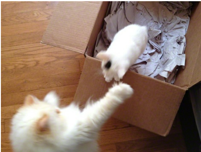
No kitten was hurt during the capturing of this image.