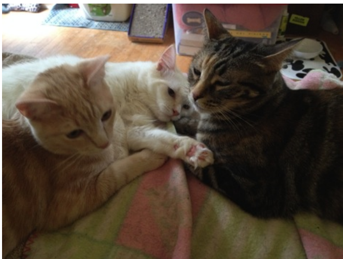
Piglet takes comfort with her grandma-Laney and Louie.

Laney, Winnie and their offspring arrived from Georgia. ALL of them broke with a nasty upper respiratory tract infection the day after they arrived. If that wasn't bad enough, I was terribly worried about Piglet because she was doing the worst of all the cats. Most of her family members got better over the next few weeks, but she didn't.