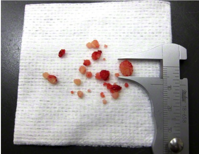
What can happen to your cat inside her bladder when she experiences long-term stress.