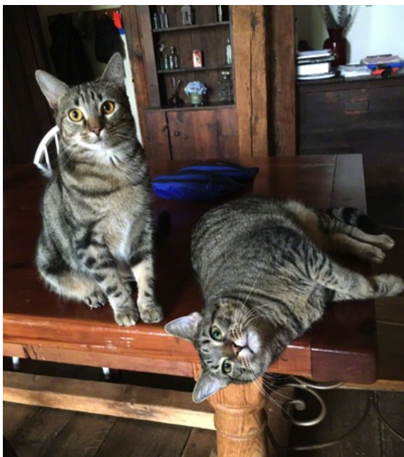
Jules (left) and Wallace (right) in their forever home.