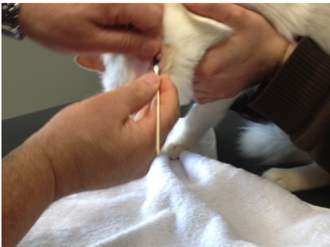
Piglet's struggles continue.

Petunia's surgery was a success. I could tell she was feeling a lot better. The cats who picked on her backed off a little bit, but ultimately we had to do more to help her so we went back to the drawing board to figure out what we could do.