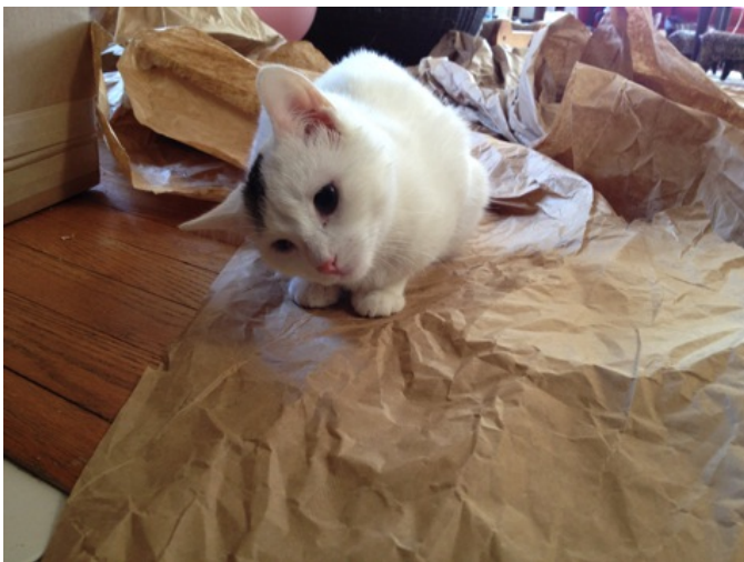
My poor baby. Head-tilt, vision problems, lovely.

At least Wallace, the tiny kitten who was rescued by the Danbury Fire Department from inside a wall, was now a big grown boy. He got adopted with the remaining "J-kitty", Jules. They looked like brother and sister and ended up getting along very well. Jules is madly in love with one of her new family's other pets—a dog named Coco. They spend too much time together, if you ask Wallace.