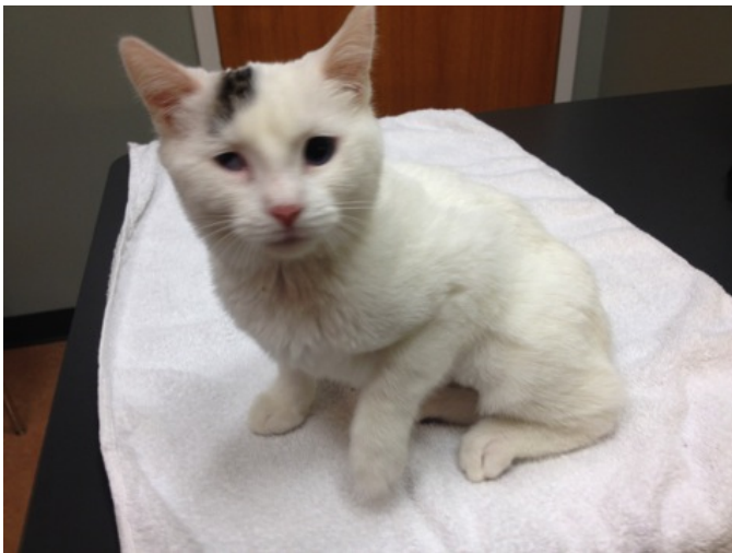
When Freya got Horner's Syndrome I thought I could handle any of her health challenges, but never seeing her turquoise blue eyes again felt like too much to bear.