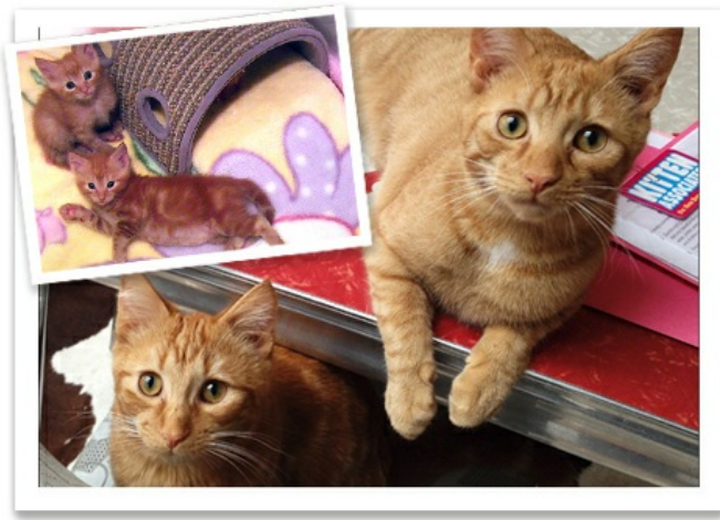
Two of Bobette's boys, Jakey & Teddy.