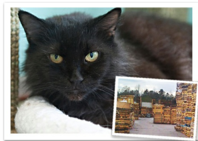
Miss Fluffy Pants shortly before being adopted.