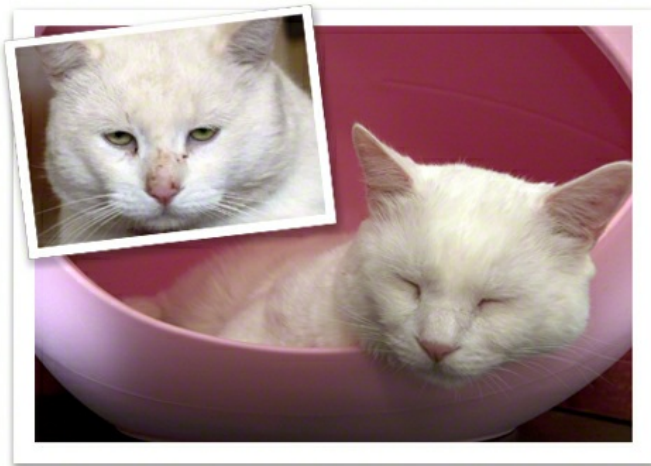
Jackson was a miserable wreck when we first took him into Kitten Associates [4] as our first rescue of 2012.

We began the year with a rescue, going beyond our comfort zone by taking on an adult, instead of an easy-to-place kitten. The cat was a huge, white, "biscuit head" tom-cat from Henry County Care & Control [1] . I saw his photo and saw something about him that made me take action. I named him Jackson Galaxy [2] in honor of the Cat Daddy/Cat Behaviorist on Animal Planet's hit show, " My Cat From Hell. " [3]