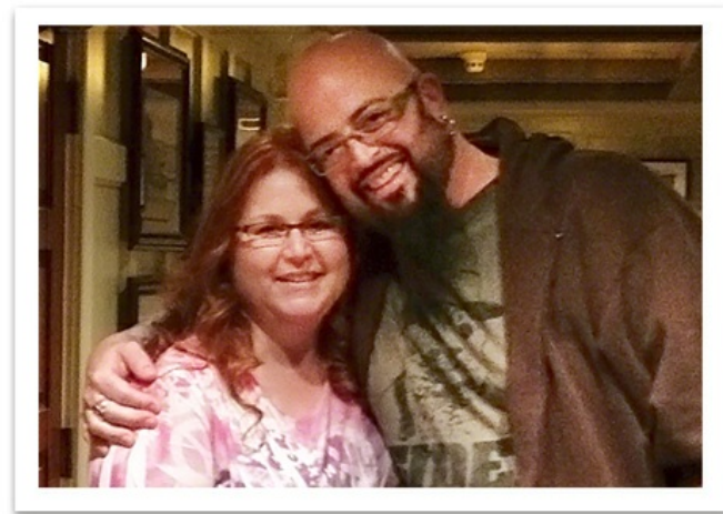
Me with Cat Daddy, Jackson Galaxy.

Jakey & Teddy were adopted together and Bobette was glad to see them leave.