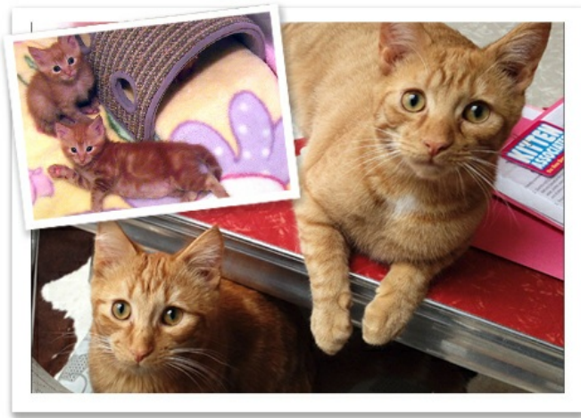
Two of Bobette's boys, Jakey & Teddy.

Bobette continued her recovery, but was still limping. I had to separate her from her boys because she hissed and growled every time she saw them. The boys, Jakey & Teddy had a blast hanging out with my cats while I continued to try to find them a great home.