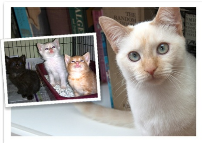
Coco, all grown up with siblings Choco and ChiChi (inset).