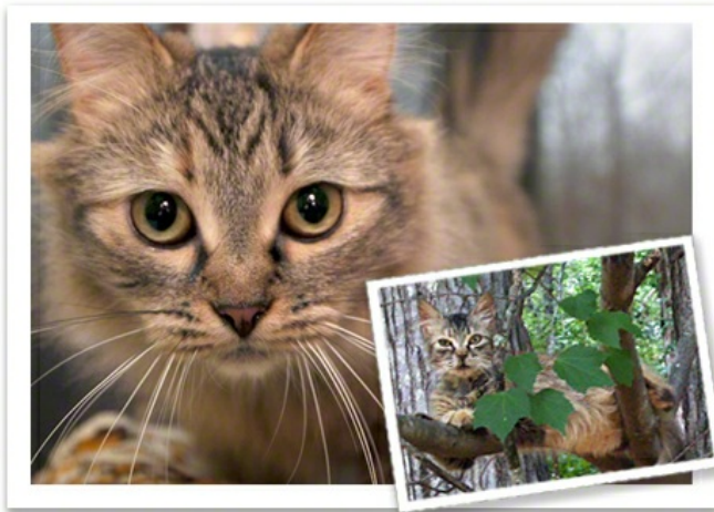
Willow is still looking for her forever home! You can visit her Petfinder page HERE [11]

Thankfully it wasn't all bad news. After months of searching, begging, dealing, I was able to get Miss Fluffy Pants transferred to Good Mews [10] in Marietta, Georgia.