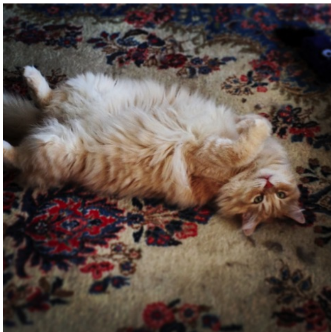
My sweet boy.