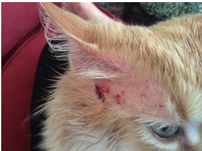
Notice how pink the skin is between his eye and ear.

I couldn't get my mind around what was going on. I treated the wound, but it got a bit worse. Blitzen's lower lip became swollen and I made an appointment with the Vet right away. I couldn't sort out what he was getting into to cause this to happen so I made sure he only got his homemade raw food, nothing commercially prepared.