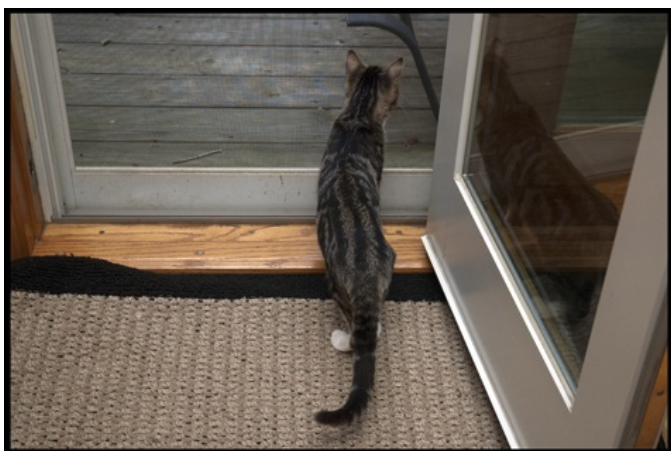
What's out there?

Cara is no longer confined to a room by herself. She's free to run around the house and make friends with some of the other kitties. Two of them were also cats we rescued! One is Precious and the other, Little Maria. They'll be featured in the next update! Right now Cara is too busy having fun, finally growing a bit and gaining some weight. She may be about six pounds, four fewer than her brother, ( Chestes ) Boris! She also has great energy and no longer shakes her head and licks at her mouth-which tells us she's no longer nauseous.