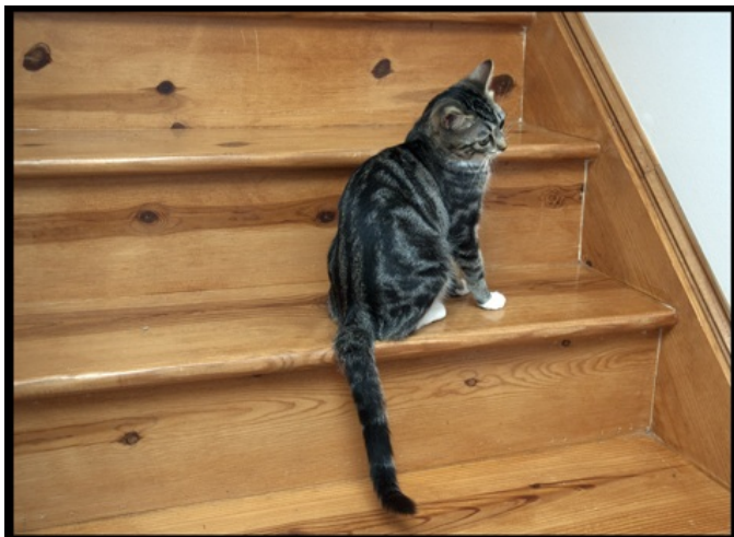
Cara's coat is like fine silk and the pattern has really come to life.