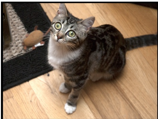
She may have grown some, but Cara still has big owly eyes!

A few days ago I visited Cara. Seeing her again was startling. I knew it was Cara, but I didn't really recognize her. She looked so much better. Her coat was silky and shiny. She ran around the house and played with the other cats. I could tell she was very happy. No more hunching over in pain. Gone was the weak and fragile kitten I spent so many hours fussing over and medicating. Before me was a thriving young lady, still tiny and with those big owly eyes. It was Cara, only a lot better.