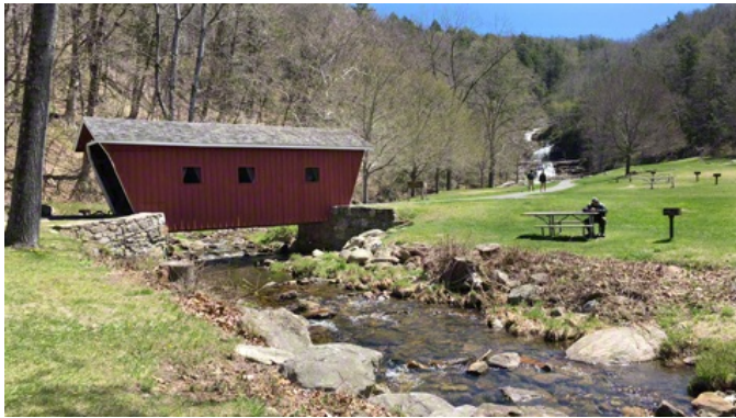
Covered bridge entrance to Kent Falls.

When I was 16, my very first serious boyfriend and I traveled about 90 minutes from my parents home to the "northwest corner" of Connecticut. My boyfriend wanted to impress me by taking me somewhere romantic and it was a big deal to be able to go so far from home, alone with a boy! I remember walking hand-in-hand with him, feeling like we'd always be together. A sparkling waterfall roared nearby, but we were too in love to hear it, busy sneaking kisses along the steep path to the top of the falls where we could kiss some more.