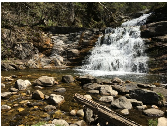
Base of Kent Falls near where I placed the stones.

I cherish this place like no other, so that's why today, on a brisk, brilliant day, I drove my car north, to Kent Falls. It was the first time I'd been there since my mother died so it was an especially meaningful trip.