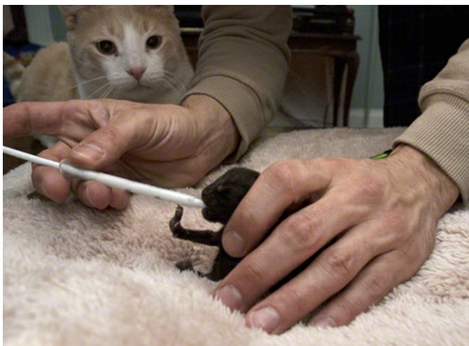
Fussy feeding time while Cupcake looks on.

Maybe they were just being quirky? I didn't know. Knowing that Mira was okay, but fragile, I left my donations with them and said to let me know if they needed anything else.