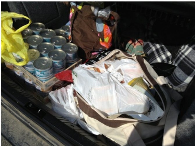
A donation of food, toys and treats filled my trunk.

it was clear they didn't have two sticks to rub together. It made me feel scared for them and also made me want to help them even more. I figured the least I could do is keep their cats fed after they told me they never meant to be in this place, but chose it from photos on the internet. Once they arrived in this central Connecticut town from their home in Pennsylvania, they realized they needed to move, but the problem was their finances couldn't cover a change any time soon. Now they had five cats and two had just given birth. I offered to get them all fixed when the time was right. Two of the cats were already spayed and a third, a young male, needed to be neutered. We agreed that once the moms were ready, we would cover the cost of getting them spayed, too.