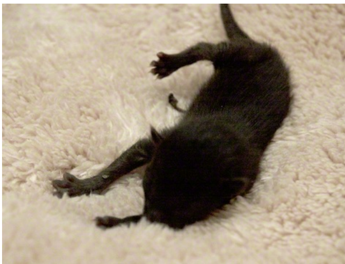
Unable to right herself, Miracle fell over but we were right there to help her sit up.

I will do what it takes to help cats and perhaps that is also my Achilles heal. Sadly, I think there are people in this world that will take advantage of that truth about me.