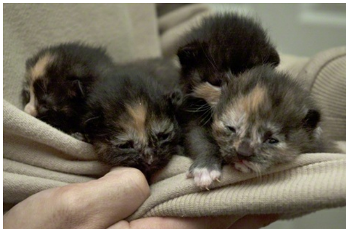
Some of the kittens I couldn't get vetted who have since been adopted.

She pushed that I had raised money to have the cats vetted so the fees were paid, so why couldn't they get the adoption fees? I'm sorry, but we don't work like that. We don't SELL kittens for profit. The fundraiser and the funds are for the cats, but we have to keep getting that money BACK or we have nothing left because vet care always costs far more than we ever can raise. As it was, I'd already spent at least $600.00 on them. Add the cost of vetting 12 cats to that and it's well beyond what we raised. It wouldn't cover the 12 cats so we'd have to dip into our account even further, but I would gladly due it to keep those cats from reproducing.