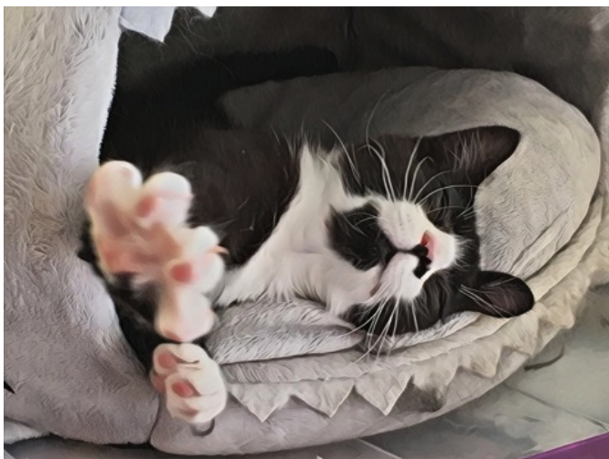
Catsheew finally learns she can relax around me.