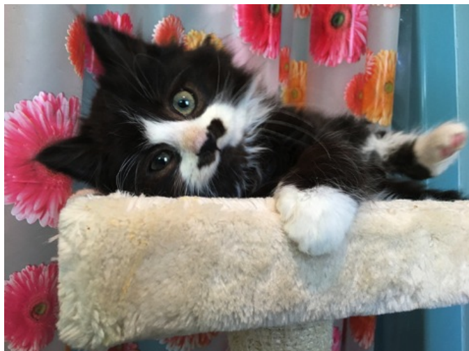
So adorable, yet so very sick.

Please think good thoughts for Pistachio and for me, too. I made a promise to this kitten a long time ago-that one day we would be friends. I kept that promise to the best of my ability, but I can't help but feel I have failed him, and that doesn't sit right with me at all.