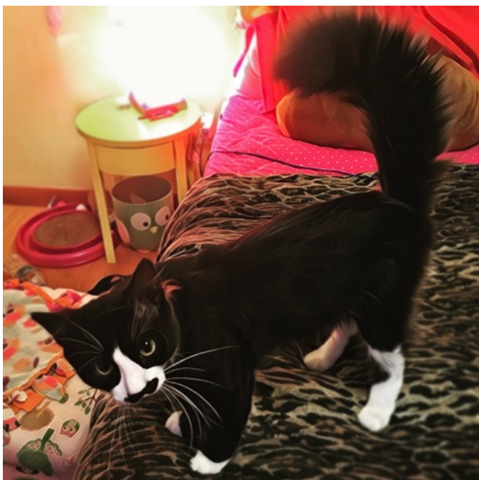
Growing up fast. Pistachio's tail floofed, while the rest of his coat is silky and smooth.

He no longer trusts me to come near him because of all the vet visits. It breaks my heart more than I can describe to lose his trust. I love this kitten so much, but I have to get him healthy and that means taking him for car trips to the vet whether he likes it or not