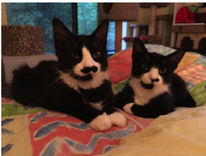
One and a half 'staches.

I've spent most of this year helping a cat I thought I'd have adopted out so long ago. It was supposed to be a quick rescue, not one that broke the bank, my heart and my back. I don't regret rescuing Pistachio and Cassie. I know they would probably be dead if I hadn't fought so hard to find out what was ailing them, but now I really need help for the final hurdle.