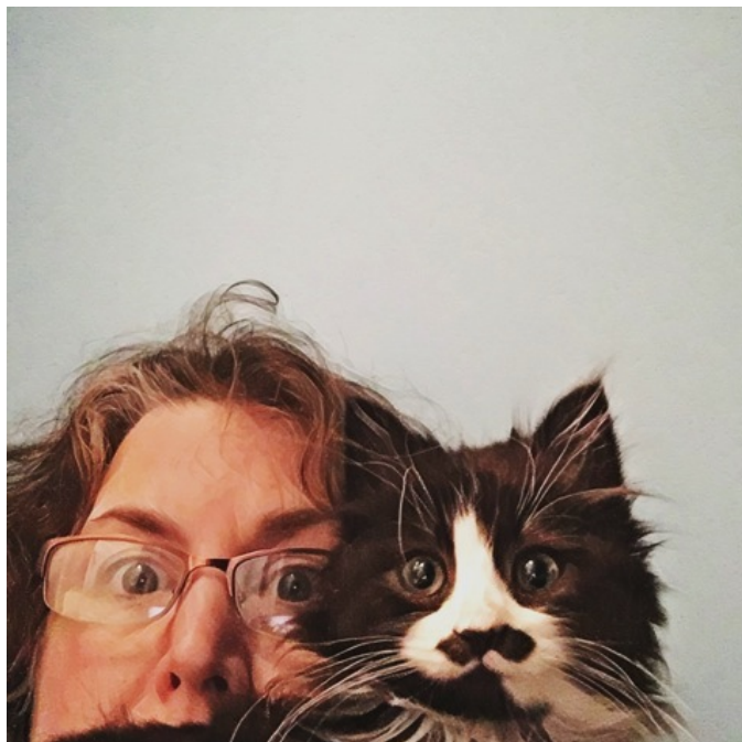
Late one night we get silly.