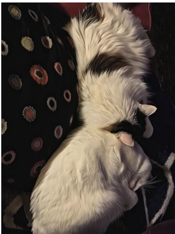
Spencer & Freya curl up together. I'm so grateful Spencer is still with us.

But Pistachio. My God. For MONTHS he coughed. MONTHS. I tried homeopathy with both kittens for about 6 weeks and their lungs got about 40% better. I was tracking every meal, if they ate, if they coughed, I timed Pistachio's coughs since he was much more severely effected, even if it was 3 AM. I wrote what kind of cough ( foamy or dry-harsh, etc ) into the notes app on my phone.