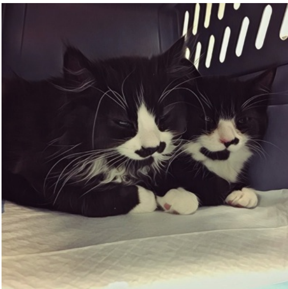
Off to the vet again.