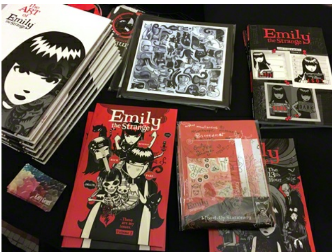
Emily the Strange goodies.