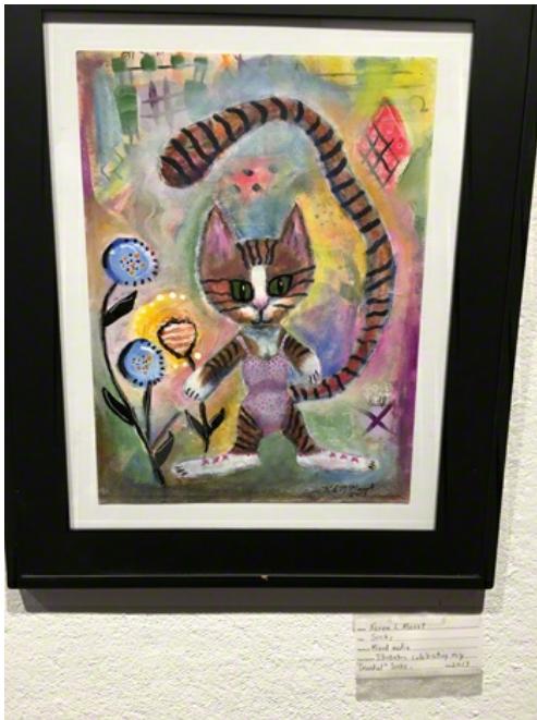
Socks by Karen Maust, 2013.

MEOW: A Cat-Inspired Exhibition runs through September 4, 2016.