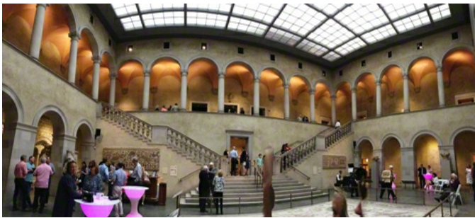
WAM interior courtyard. where we got chastised for almost leaning on the walls (the docent said "everything here is art!").

It was the place to fly your furry feline flag meanwhile celebrating artwork from modern day submissions by the community, to an Albrecht Dürer (2) woodcut from the 15th century. There were also varying cat-centric pieces of art peppered throughout the museum in addition to two special installations featuring a wide range of artistic styles.