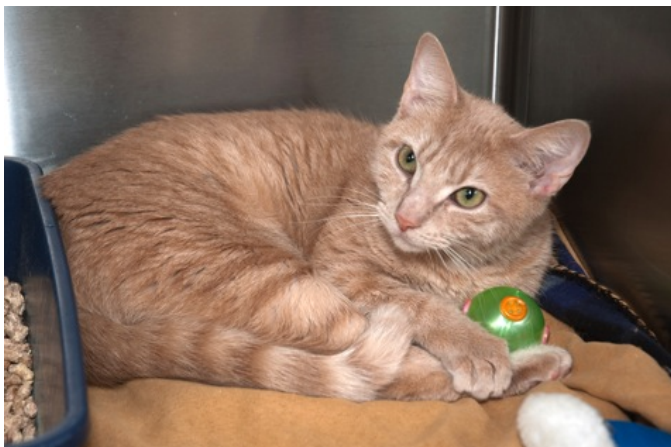
#06, Sweet Peaches, about a year old, who's looking for her forever home or a rescue organization to take her on and help her find one.

She said that she counted how many cats there were and she counted one cat for every one of her toes, then she ran out of toes! So she said there were must be more than 18. I guess her sister had a kitten that went right to Heaven and then another sister got really really sick from being full of babies and she almost went to Heaven, too.