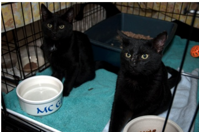
#05 & #09, Silly 7-month old siblings looking for their forever home or a rescue organization to take them on and help them find one.

My brothers are small, but I am the smallest. The ladies said I am...I dunno. Something about bread, being in-bread? They say I should be more developed by now, but geez, I'm doing the best I can.